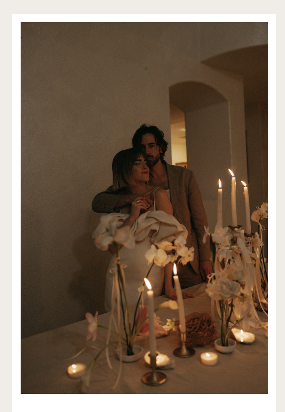
Wedding Packages PRICE GUIDE